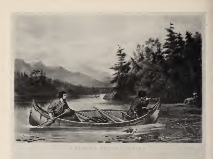
"A GOOD CHANCE"—1863 [NUMBER 308]

308 AMERICAN HUNTING SCENES—A GOOD CHANCE Litho. Currier & Ives, after painting by A. F. Tait. Dated 1863. Large folio.